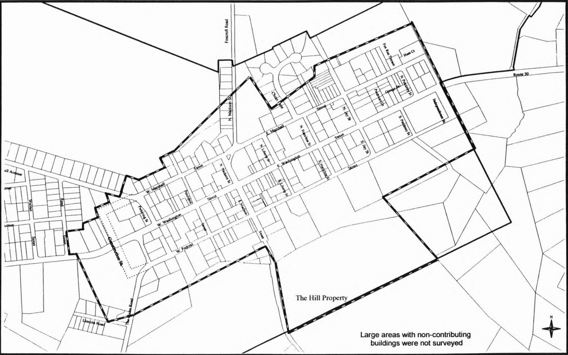
Map 1: Boundary of Surveyed Area Town of Middleburg