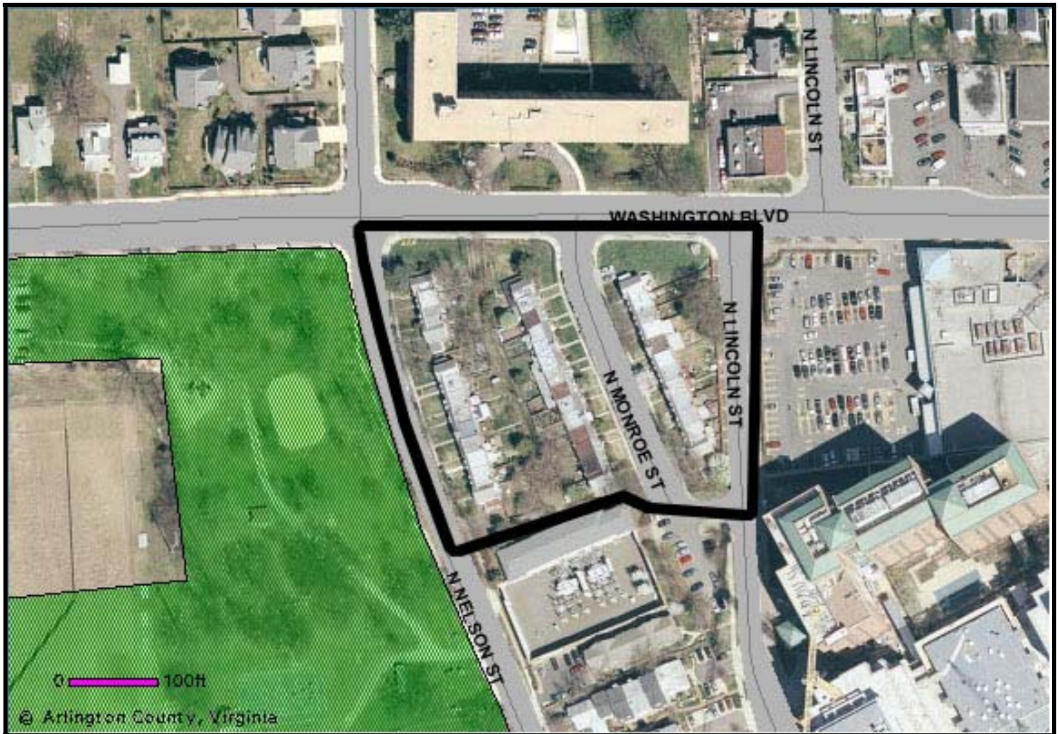
2005 AERIAL MAP