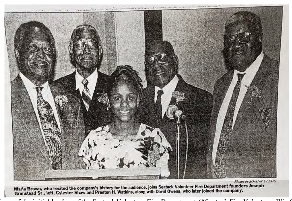
Figure 16. Some of the initial leaders of the Seatack Volunteer Fire Department. ("Seatack Fire Volunteers Win Certificates," Virginia Beach Beacon, February 17, 1995.)

After completing their training, each man was tested and received a Certificate of Credit in Industrial Education (Elementary Firemenship) from the state Board for Vocational Education of Virginia. The members of the fire department went on to win advanced fire instruction certificates which were awarded at the Seatack Fire House in a special ceremony. The Seatack Department was the "first and only Negro fire department in Virginia…"<sup>50</sup> To support the department in the 1950s, the wives of the volunteers formed a twelve-woman auxiliary to raise funds for the department; they went door to door for donations and sold lunches and dinners. At the ceremony for the advanced certificates, Fire Chief Bayne noted that the Seatack department had raised more than $4,000 since it had been formed two years earlier.<sup>51</sup>