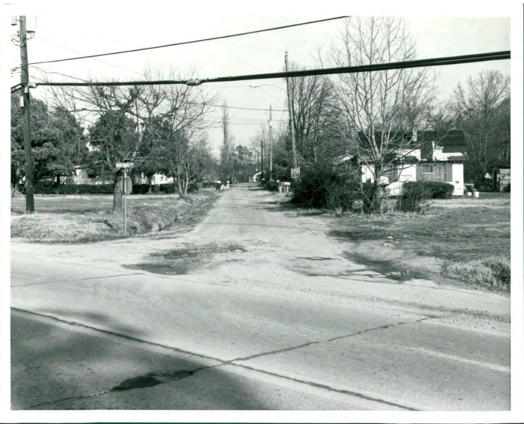
Figure 22. Seatack Burford(s) Avenue, North East from Birdneck. Target Neighborhood Program, Phase 1. Ca. 1975.

The two communities of Atlantic Park and Burton Station were eventually excluded from the plan because of their proximity to Oceana Naval Air Station and the Norfolk International Airport respectively.<sup>113</sup> For the other ten neighborhoods, the final result was the establishment of city water and sewer services, sidewalks, street lights, paved roads, and other needed improvements. These changes resulted in many renovated homes as well as a significant amount of new construction and infill development. The contradiction which resulted for a majority of these African American communities is that they were saved for their residents in regards to quality of life, but at the cost of a significant loss of historic fabric and identity.