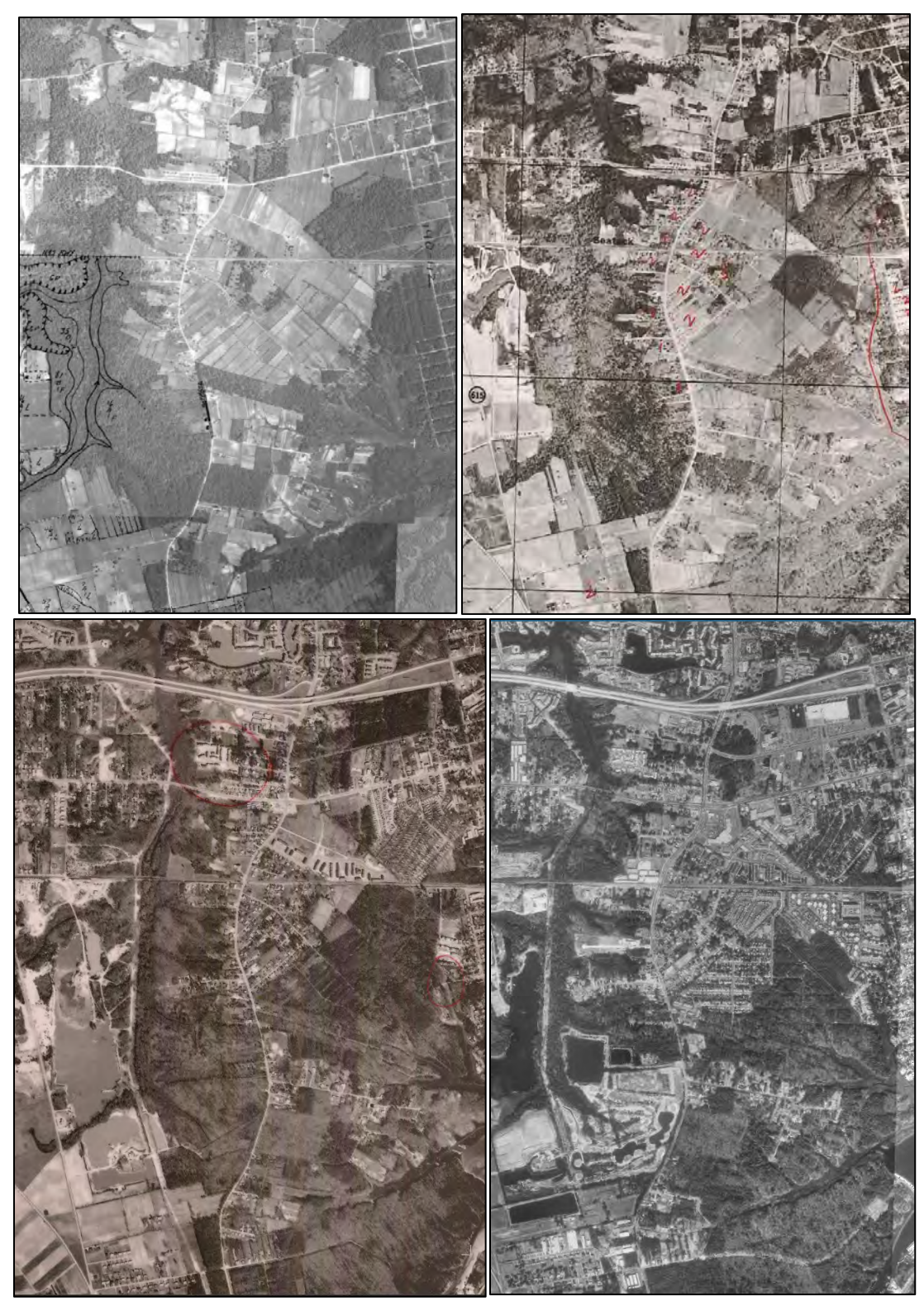
Figure 1. Historic aerials of the Seatack Neighborhood showing the growth from predominantly rural farmland to developed suburban neighborhood. Left to right, starting at the top left: 1937, 1954, 1974, 1994. (City of Virginia Beach Historic Aerial Viewer https://virginiabeach.gov/services/map-center)