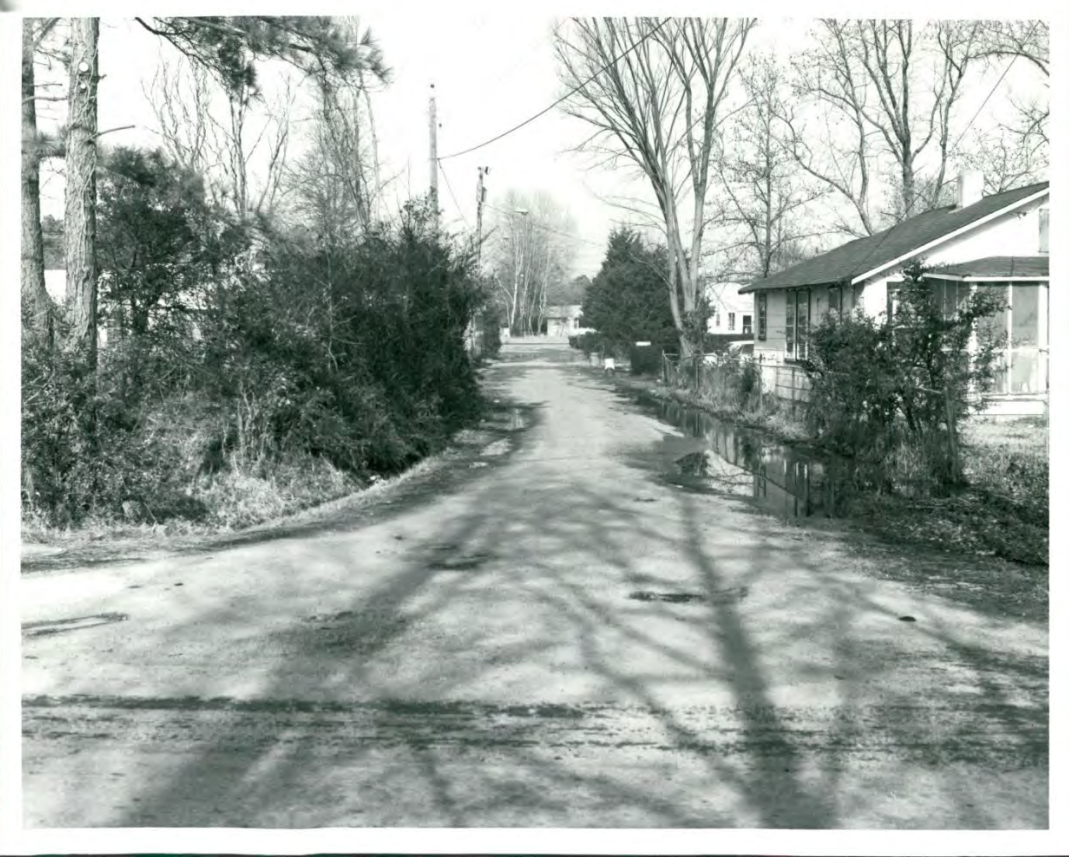
Figure 21. Seatack Bu[r]ford Avenue, North from Longstreet Avenue. Target Neighborhood Program, Phase 1. Ca. 1975.

However, the story of Seatack did not end in 1969. In 1975 the City of Virginia Beach authorized the "Target Neighborhood Program" with the goal of providing basic services and infrastructure improvements to twelve targeted neighborhoods: Atlantic Park, Beechwood, Burton Station, Doyletown, Gracetown, Lake Smith, Mill Dam, Newlight, Newsome Farm, Queen City, Reedtown and Seatack.<sup>111</sup> All of these neighborhoods were historically African American communities. While this program was eventually largely successful, it took more than twenty years to complete because the city chose to rely on federal block grants, which significantly extended the time frame for the projects. Eventually more than $40 million in federal, and $10 million in local matching funds, was spent on ten of the communities, accomplishing significant change. However, along with the insistence on relying on the U.S. Department of Housing and Urban Development (HUD) funds, the city also skirted the rules of the federal programs repeatedly. In 1978 the city was called out by HUD for charging residents for work that had already been funded by federal dollars. The next year HUD almost cut off funds because of the refusal by the city to renovate substandard housing, as required by the grants.<sup>112</sup>