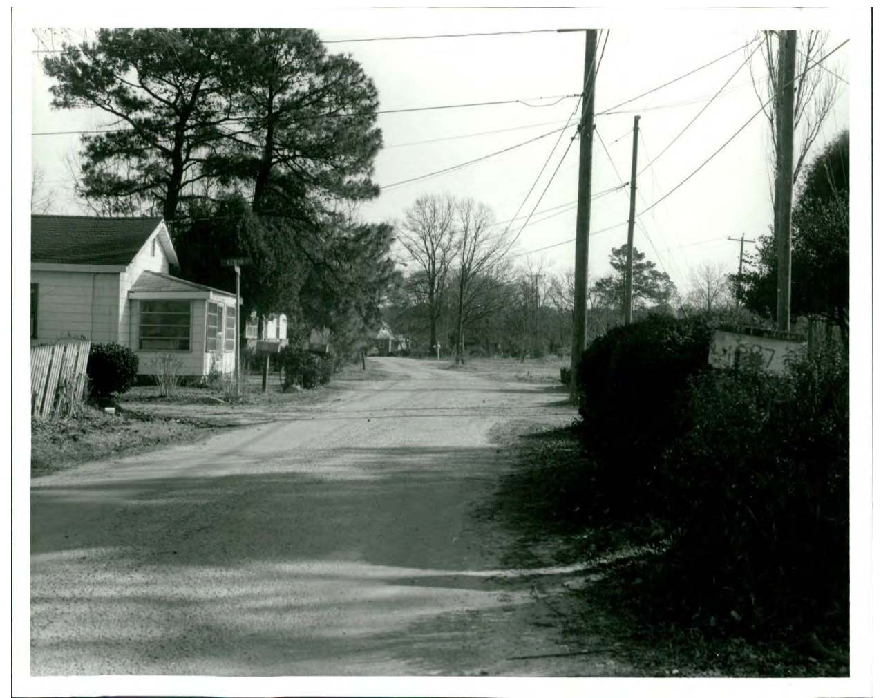
Figure 20. Seatack Kenya Lane east toward dead end, near Kenya Court. Target Neighborhood Program, Phase 1. Ca. 1975.

"upgrading conditions in Seatack."<sup>109</sup> These apartment complexes did address the dramatic need for housing in the community. The 1960 Census set the population of Seatack at 3,345 with only 914 housing units available.<sup>110</sup> However, while serving as a release valve for the acute housing pressures, these large apartment buildings began to significantly change the character of some areas of the neighborhood. These changes were first reflected in the dramatic geographic shift with large undeveloped, previously agricultural parcels transformed into apartment complexes housing hundreds of residents in a very small footprint. But just as dramatic was the transformation of Seatack from a community which resembled a small town to one that increasingly reflected a more traditional suburban character. The announcement of these changes justifies ending the Period of Significance at the end of 1969, before the completion of these new developments in the early-to-mid 1970s.