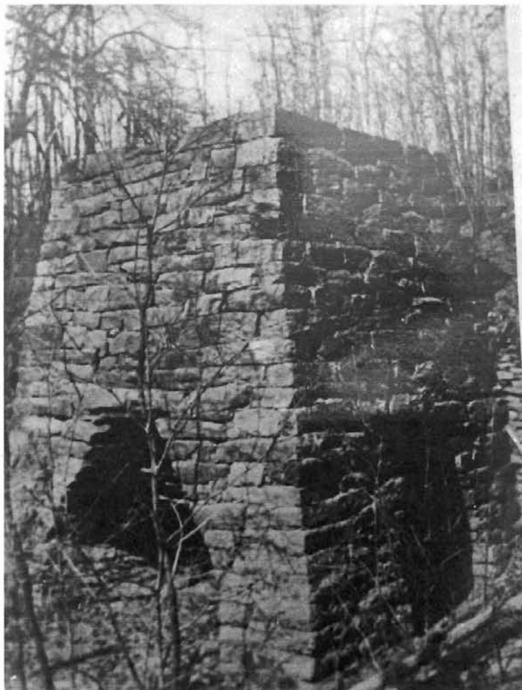
Figure 2. Composite image of undated photographs of the West Fork Furnace (VDHR # 031-0085, 44FD0048).