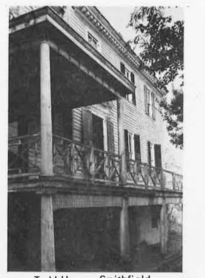
Todd House, Smithfield

YORKTOWN WRECKS ARCHAEOLOGICAL SITE, YORK COUNTY: This site includes the underwater remains of those British warships, transports, and assorted boats sunk off Yorktown during the siege of 1781.