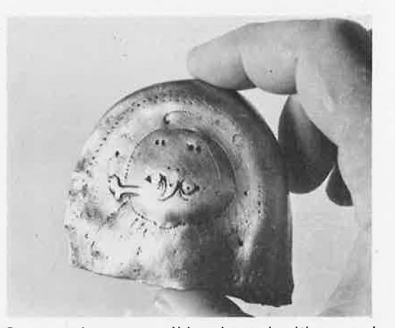
Copper tobacco can lid embossed with an owl smoking a mid-seventeenth century style pipe found at the bottom of a seventeenth century well on the Pettus' Plantation at Kingsmill.

a porch or shed to the west. Two additional post buildings, one with a <u>cellar</u>, were found to the west along with the brick-lined well, abandoned ca. 1690. The two outbuildings will be more fully explored in the spring.