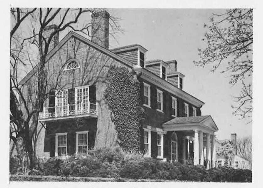
MORVEN, ALBEMARLE COUNTY: The sophisticated early-19th century house, magnificent location and grounds, combine to make Morven one of Piedmont Virginia's more memorable estates.

DANVILLE HISTORIC DISTRICT: Few Southern communities can boast late-19th century neighborhoods of such elegance as Danville's Main Street