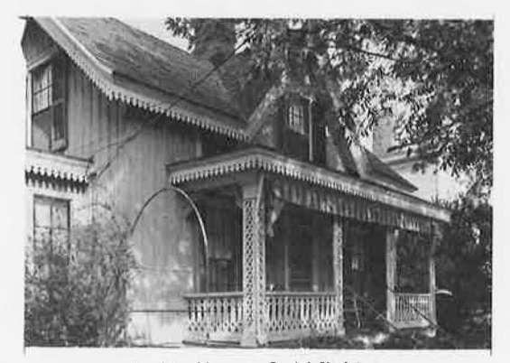
Boykin House, Smithfield

HICKORY NECK CHURCH, JAMES CITY COUNTY: This tiny brick building, the remaining portion of the Lower Church of colonial Blisland Parish, was reconcecrated in 1907 following prolonged service as an Academy.