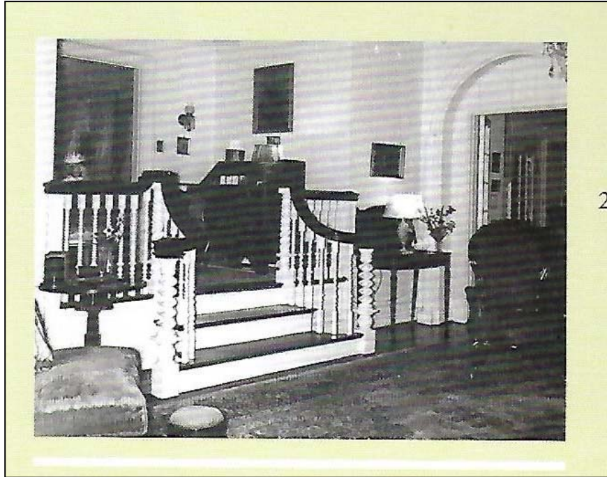
Figure 2. Undated photo of staircase at Brookside, Stanhope S. Johnson's home in Lynchburg.

Section number Additional Documentation Page 4