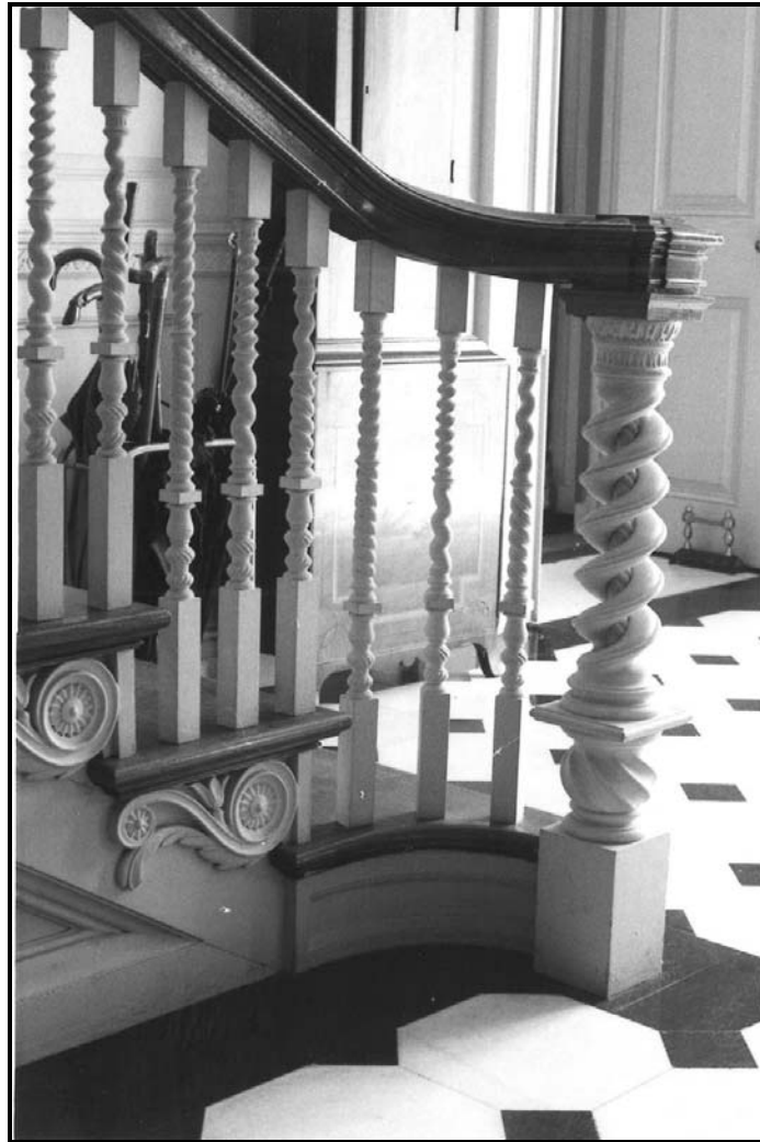
Figure 5. Detail of Staircase Newel Post and Balusters at Gallison Hall