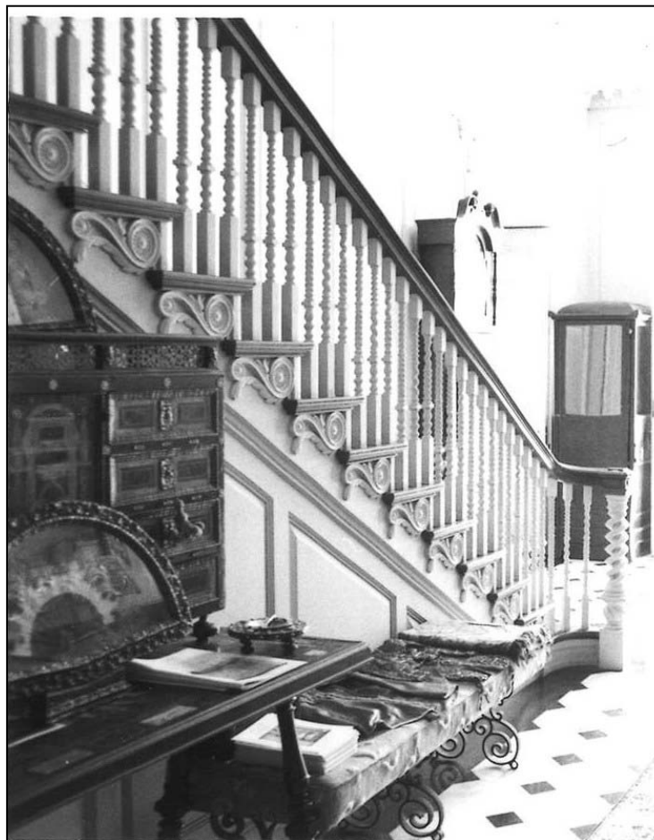
Figure 4. Staircase at Gallison Hall (1981 photo by Jeffrey M. O'Dell, collection of the Department of Historic Resources, Richmond, VA)