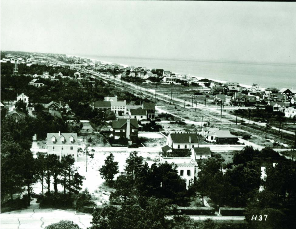
Historic Photo 2: Bird's Eye View of Cavalier Shores from Cavalier Hotel, Circa 1930s Unknown Artist.