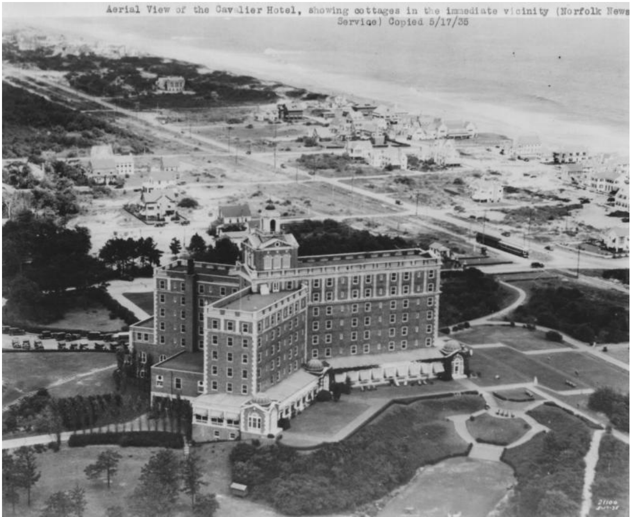
Historic Photo 1: Aerial View of the Cavalier Hotel, Depicting Cavalier Shores in Background, Circa 1930s