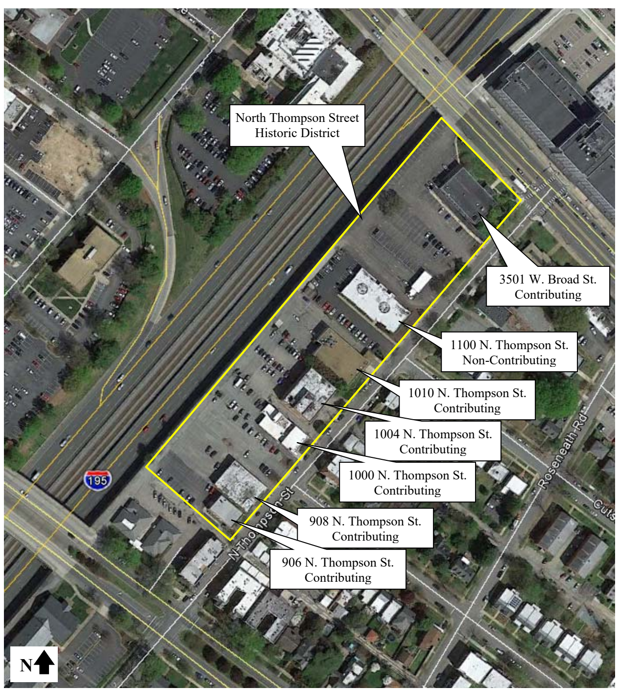
Aerial Photograph: North Thompson Street Historic District Google Earth Image, 2016